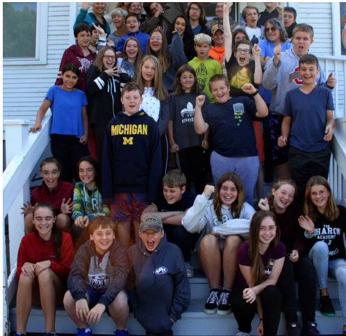
Our Middle School Students, 2019 2020