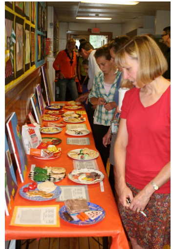
Parents view the ceramic "meals" students created in Art Class as a part of the Food and Hunger unit

The year begins with the theme of Human Rights . In Social Studies, we explore the structure of the US government and our rights as citizens of Vermont and of the United States. This includes a study of our founding documents and their relevance to our lives. Science class explores what all living things have in common, the structures and functions of cells, and genetics. With this knowledge, we are ready to investigate how humans are all similar but different because of both environmental and genetic factors. Students are then prepared to question why some people have been afforded different rights throughout history. Health class addresses human reproduction and development from egg to birth. In Language Arts, students read To Kill a Mockingbird , by Harper Lee and The Hate U Give , by Angie Thomas. Both of these books explore themes of prejudice and justice at different times in American history. The culminating writing project for this unit is a persuasive essay about a controversial human rights issue.