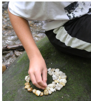
Art: Student making art in the forest behind The Sharon Academy High School after studying Andy Goldsworthy

The second theme of the year asks students to consider their identity through the lens of World Beliefs . Students ask themselves how science, religion, and family values shape who they are and what they believe. The Social Studies curriculum focuses on major world religions and the traditions and cultures that have arisen from these religions. After learning how Judaism, Christianity, and Islam address the philosophical questions of "What happens after death?" and "How should I live my life?," students have a chance to research a world religion of their choosing. Over the course of a month, they hone their research and writing skills, culminating in a final oral presentation to teach others about their chosen religion. In Language Arts, book selections include Refugee by Alan Gratz, the story of three refugees whose lives overlap and intertwine, and Night by Elie Wiesel, the story of the author's experience in a concentration camp. Students write a personal essay entitled "This I Believe," outlining a personal belief or ideal. As a counterpoint to the study of religion, Science class examines how scientific theories develop from a body of evidence and are subject to change. Students explore the basic properties of matter, and study basic chemistry to look at life and the origin of the universe through a scientific lens.