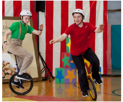
The Middle School Circus

Transferable Skills • Twenty-first century skills such as critical thinking, perseverance, creative problem solving, effective communication (written and verbal), and commitment to community are practiced throughout the curriculum. Students read six or more assigned books each year and three more of their own choosing. Developmentally appropriate literature is selected for its value in terms of language, voice, and relevance. Students exercise analytical skills as they read and discuss writing style and themes. Reading of textbooks and other non-fiction (i.e. articles from current journals, news media, books) is regularly assigned in Science and Social Studies and discussed both in terms of the content and the reading skills required. Writing is intensive throughout the curriculum. Students are continually practicing the basic rules of grammar and punctuation. In longer pieces of writing, the emphasis is on research, the production of original work, and the mechanics and style of writing. Discussion-based classrooms give ample opportunity for listening and speaking. Students are required to deliver numerous oral presentations throughout the two years.