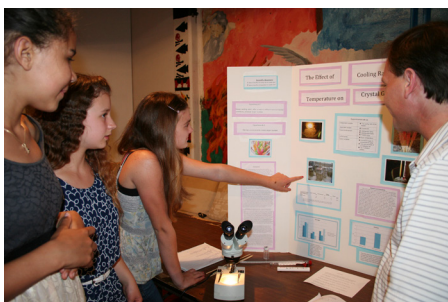
Students present their findings at the Science Fair

Science Fair • Every year, students spend six to eight weeks designing and conducting experiments as a part of our Science Fair. Students work with our science teacher to develop their own scientific question and carry out the experiments. This culminates in a public poster session of their results in June, where students give in-depth descriptions of their research to the public. For a list of last year's Science Fair projects, please see the following page.