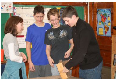
Social Studies: Learning to card wool while learning about the Industrial Revolution in the Energy unit

Next we move into the study of Energy and Sustainability . The unit opens with a showing and discussion of the controversial documentary, An Inconvenient Truth , to introduce students to the complex relationship between resource consumption and climate change. In Social Studies, we study the history of industrialization and energy use. As we learn about the Industrial Revolution in Vermont and the US, we discuss the ethical and environmental impact of our modern resource consumption. In Science, we study energy, energy transfers, and basic principles of electricity and electrical generators. We also look at the composition of the atmosphere to understand the term "carbon footprint" and to draw connections between climate change and energy use. In