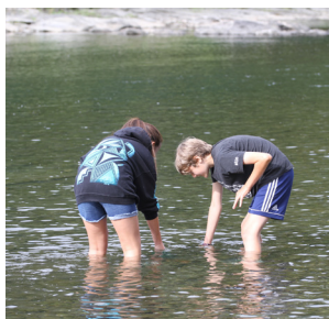
Science: Students catching rusty crayfish in the White River to study invasive species

reflecting on how Vermont culture compares to other regions through multi-media exchanges with students in other parts of the world. In Science, students spend a great deal of time outside learning ecology and biodiversity through a local lens. Students collect and study the Rusty Crayfish, an invasive species in the White River; do a biodiversity inventory of the local forest; learn to identify native trees and examine how their adaptations make them uniquely adapted to our climate; and analyze data about local bobcat, deer and hare populations to draw conclusions about food webs. Students apply their map and compass skills from Social Studies on an orienteering course focused on tree identification. In